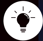
Energy Management Services