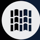
Asbestos Risk Management and Consultancy Services