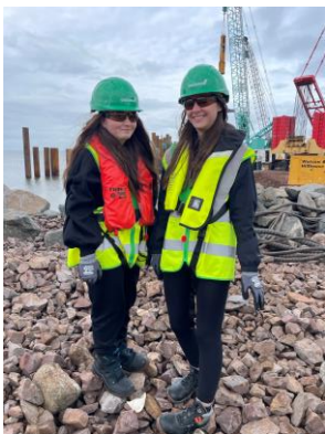
Above: Talking Careers with Leith Academy Left: Students from Working Rite