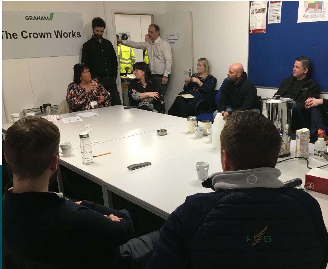
Supply Chain Breakfast Event at Crown Works