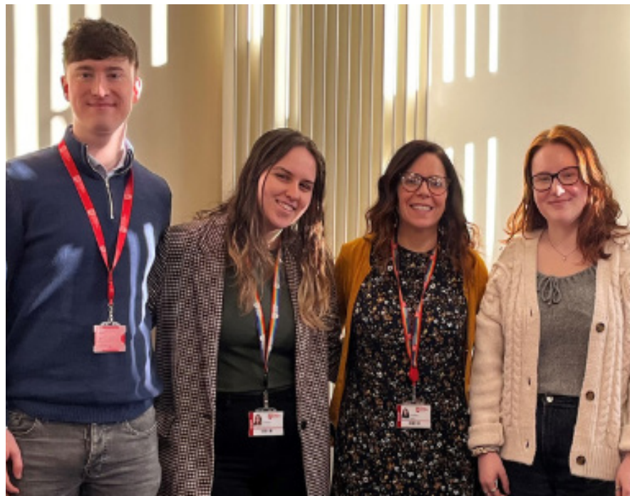
Community Opportunities Event At NICVA

We were pleased to welcome 30 representatives from voluntary, community and social enterprise organisations, employability specialists and educational providers across North Belfast. The event provided an opportunity to meet with our teams and partner organisations to find out more about the project works and the range of opportunities available through the project