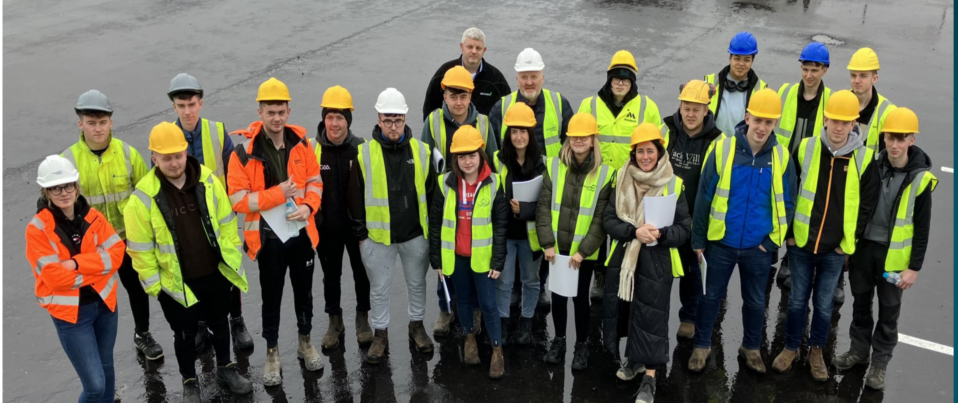
BFS College Site Visit