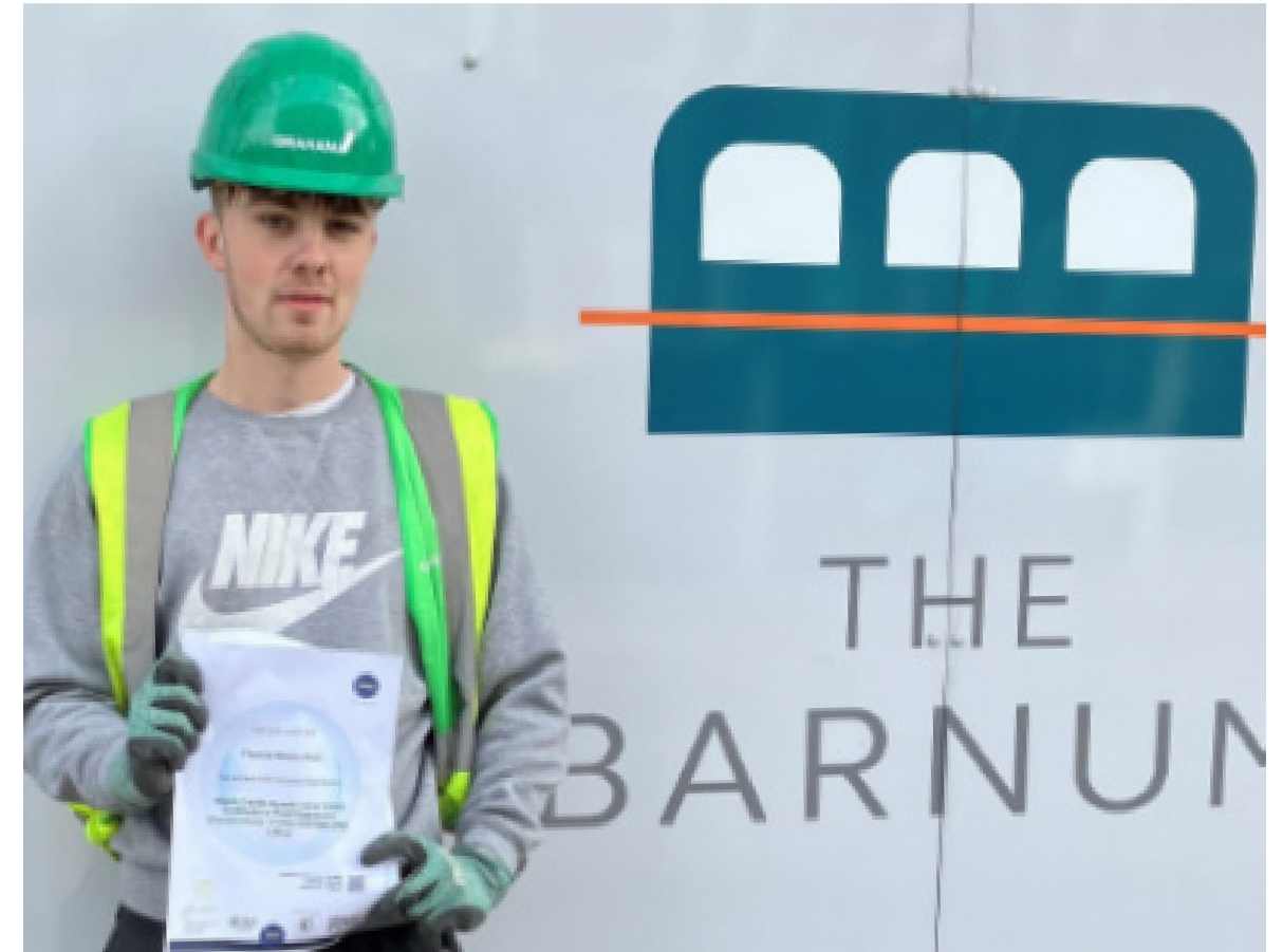
Midlands’ Workforce Invest £65k to Support Training and Development

Throughout the event, supply chain workforces met with providers to discover which route complimented their existing skills and on-site duties, resulting in many people upgrading their CSCS Site Operative card to a blue skilled card through their NVQ L2+ accreditations.