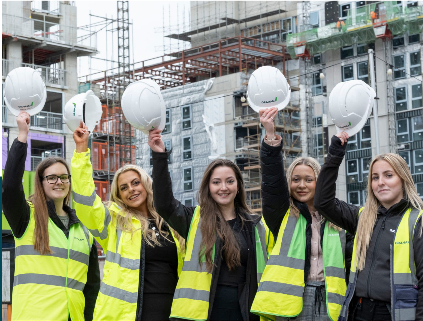
Scottish Apprenticeship Week