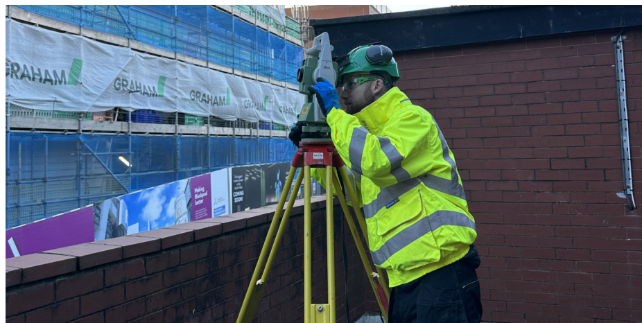
PlanBEE Scheme delivers A+ Apprentices

This two-year, multi-disciplinary programme helps to meet the need for skilled employees in the North West construction sector and equip young people to thrive in the industry, which is rapidly evolving with new construction methods and technologies.