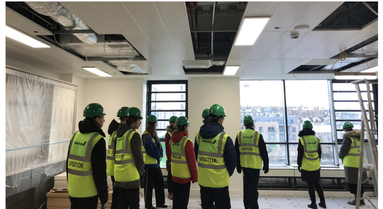
Boroughmuir High School Site Visit