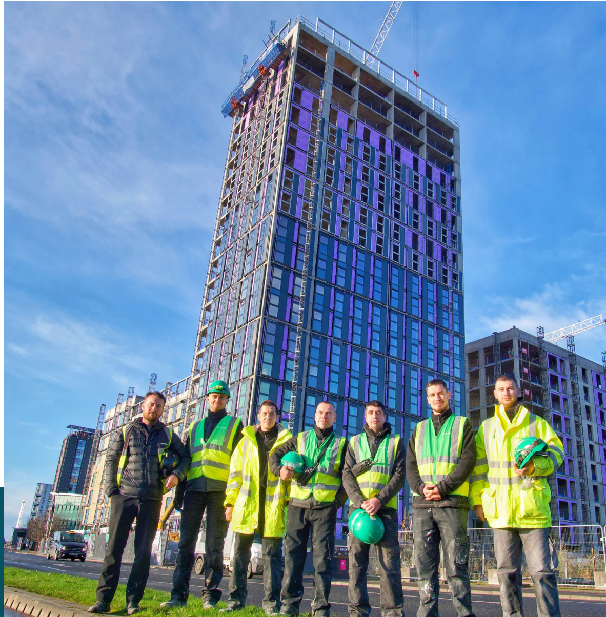
GRAHAM Outlines Commitment to Encouraging Construction Workers from priority and under-represented groups