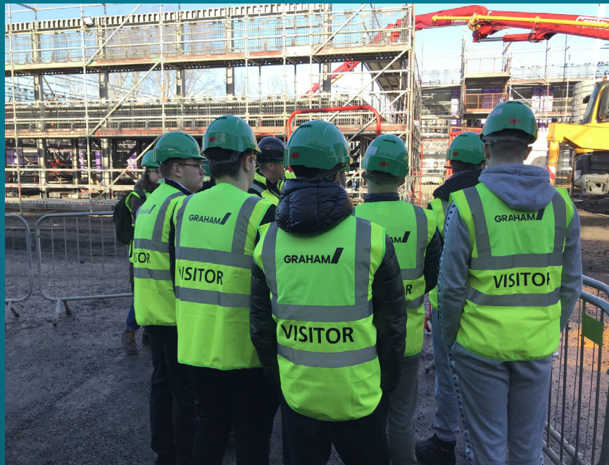
Site Visit with Barnardo's Construction Programme at Bonnington Road, Edinburgh