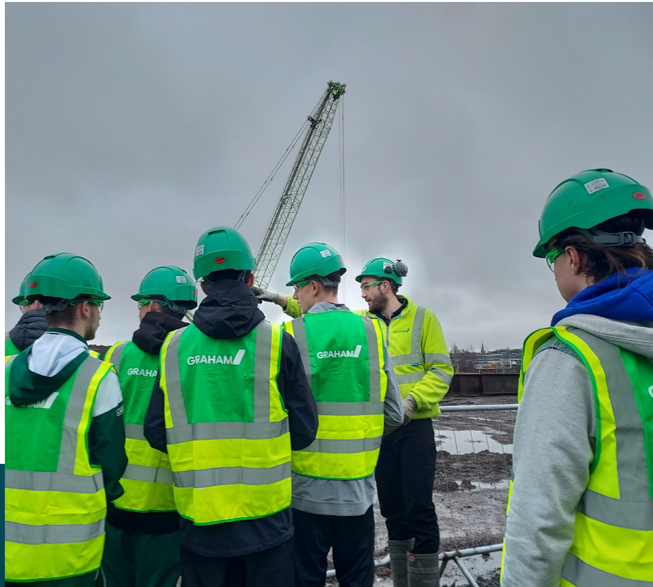
Welcoming the Working 4U Dunbartonshire Training Academy to the CWRR Project