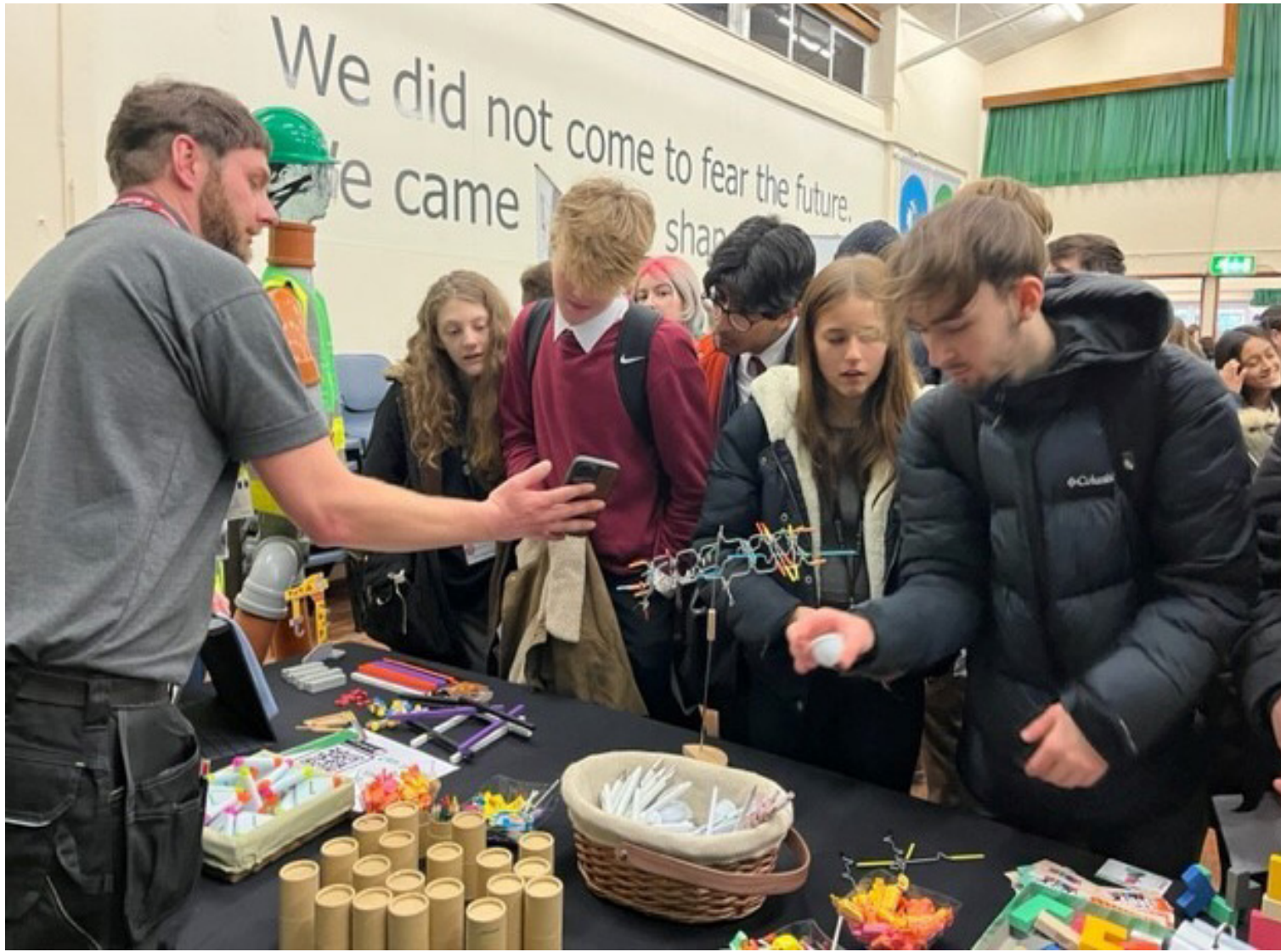
GRAHAM Asset Management Attend School Careers Day and SEN presentation at St Birinus School