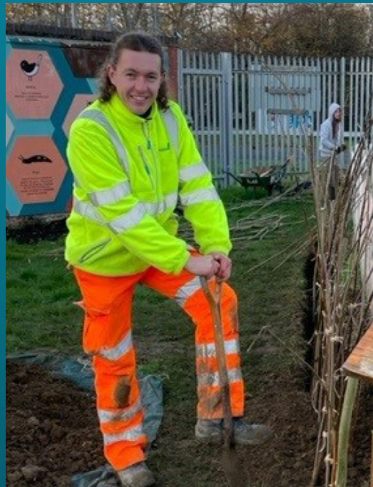
Volunteering at West Raven Community Garden

They support residents with health and wellbeing, employability and youth programmes, tackling social isolation, exclusion and environmental issues through their Community Café & Garden.